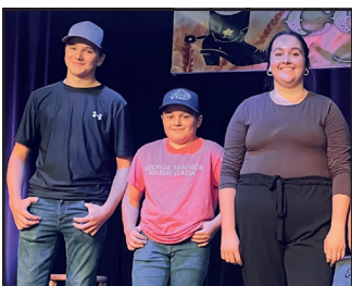
JEUNES MUSIENS ÉVANGÉLINE (PEI)