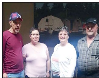
HEARTFELT BLUEGRASS (PEI)