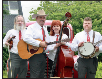
BLUEGRASS TRADITION (NS)