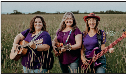
TREBLE MAKERS (PEI)