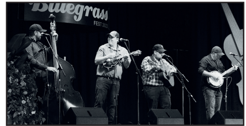
HIGH RIVER (NB)