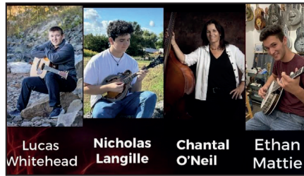
COUNTY CONNECTIONS (NS)