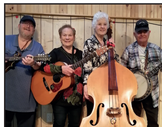
SK BLUEGRASS (PEI)