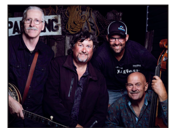
BLUEGRASS DIAMONDS (NB)